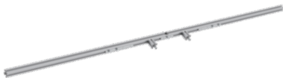
TV Bar 79"