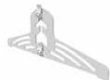
Side Foot (2)