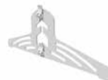
Side Foot (2)