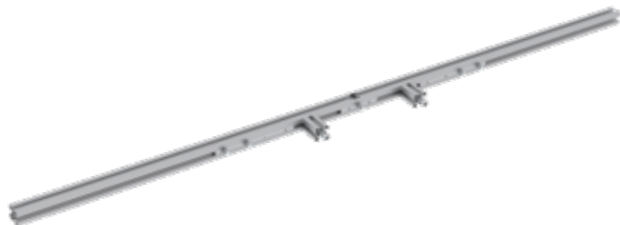
TV Bar 60"