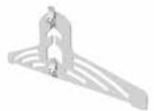
Side Foot (2)