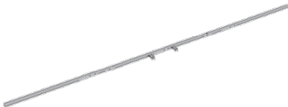
TV Bar 118”